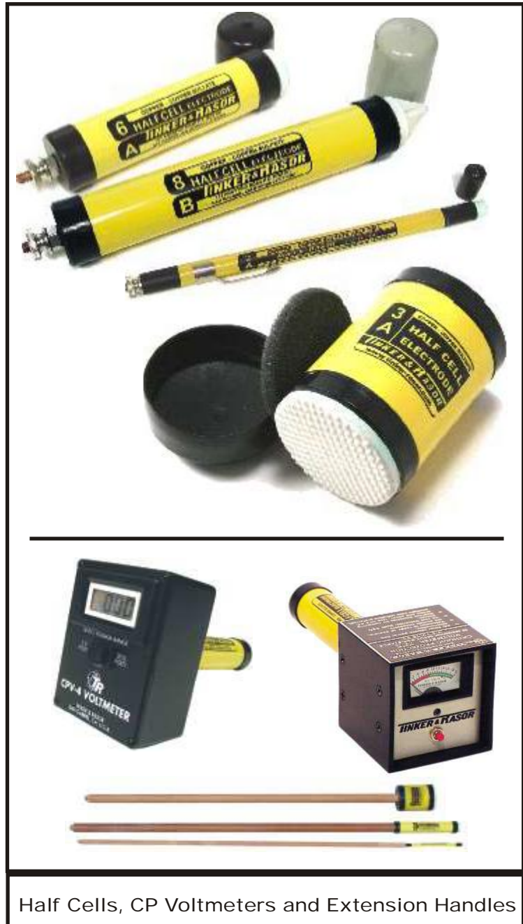
Half Cells, CP Voltmeters and Extension Handles